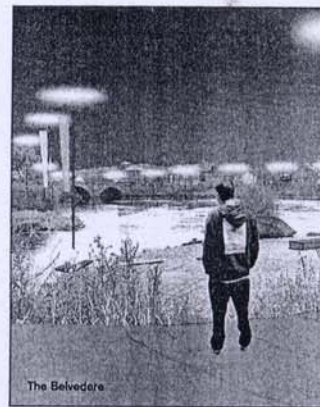
The Belvedere New look: Plans for a river crossing pro architectural practice McDowell and Be

The once-polluted river is returning to its natural state of 200 years ago, he said.